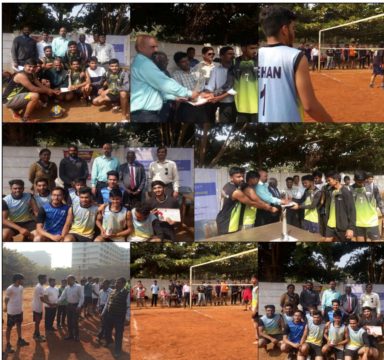
Sinhgad Sports Karandak